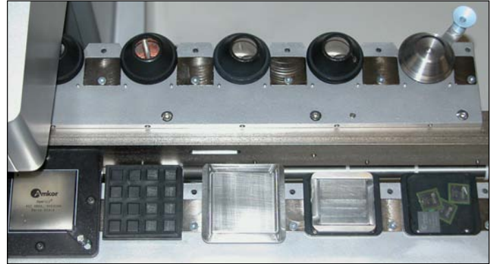
POCKET SYSTEM (5 OR 10 STATIONS)