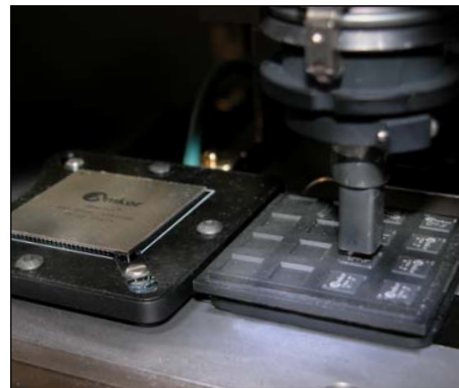
COMPONENT TRAY PICK