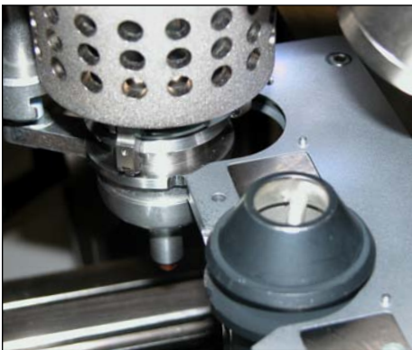
AUTOMATIC TOOL CHANGE